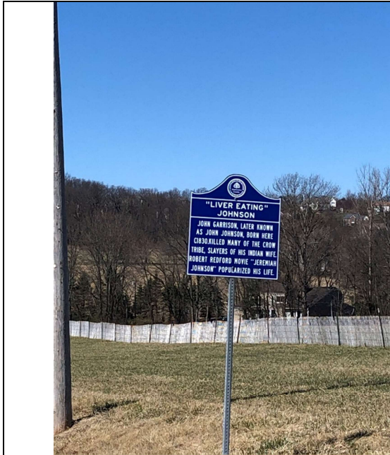
Historical Marker near intersection of Hunterdon Routes 579 & 614. The marker commemorates the life and times of “Liver Eating Johnson”, native son of New Jersey, whose life was popularized by Robert Redford in the movie “Jeremiah Johnson”.