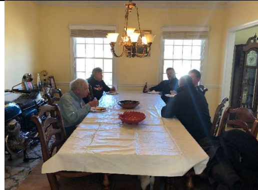
One of several lunch breakout groups throughout the house