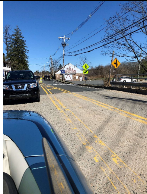
Just turned onto Pittstown Road (Rt 615) following Route 579 through Pittstown. The lettering on the barn state “So This Is Pittstown”. Draw your own conclusions. Frankly, I think it’s a great marketing strategy.

Although our daily lives have changed dramatically these past few days, the one thing we can still do without restriction (at least for now) – go for a ride!