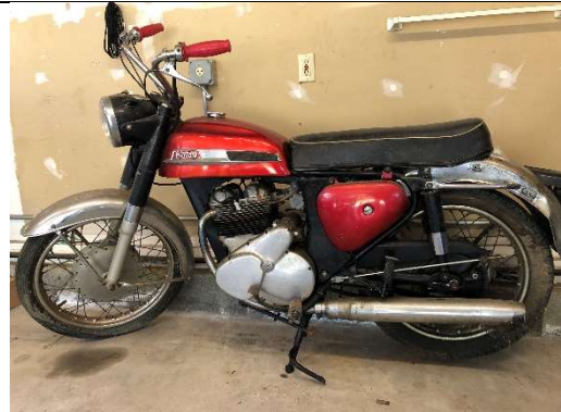
Newly acquired Norton Electra awaiting attention. This bike is complete which is a rarity. Tin ware for this model is very scarce. Ya gotta love those grips!